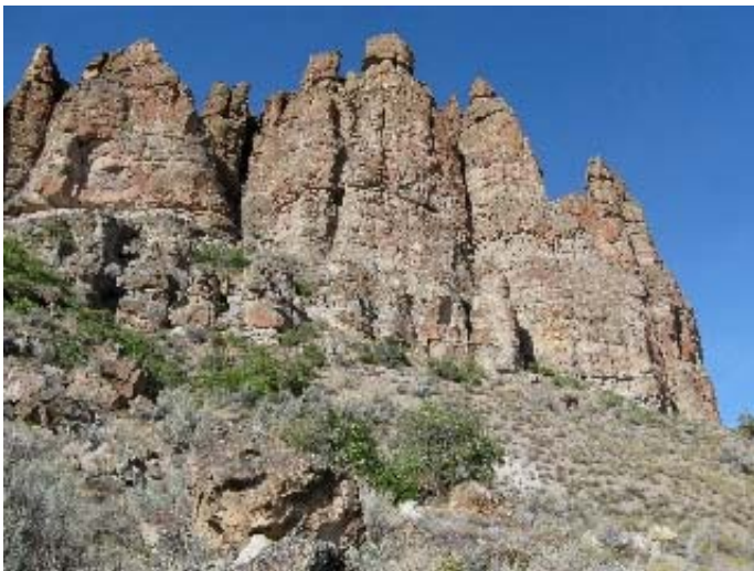
Camp Hancock scenery

The camp was held at the Hancock Field Station operated by the Oregon Museum of Science & Industry in Portland. It was located near Fossil, Oregon and a name like that was itself a lure to tempt a rockhound. The camp was like a summer camp, bunkhouses, eating-gathering area, rooms for the different classes, and a variety of hiking trails. The lapidary area was great. It was under a shelter, but open to the elements. Pretty neat idea cause the daily messes could be cleaned up a bit easier.