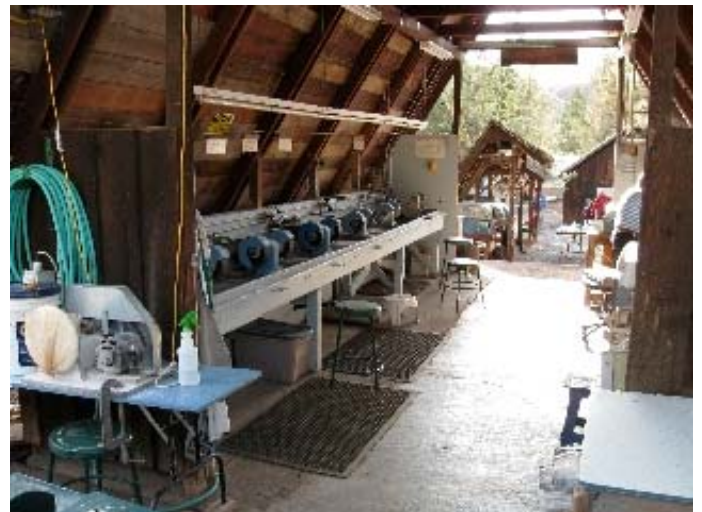
Lapidary shop at Camp Hancock

Turns out we were the very first folks to sign up for the '08 retreat. Good thing we did because it was a total sell out. The event had finally caught on with the rockhound community after a few sketchy years with Lamar Tilgner keeping it propped up and limping along. That is not a problem any longer—